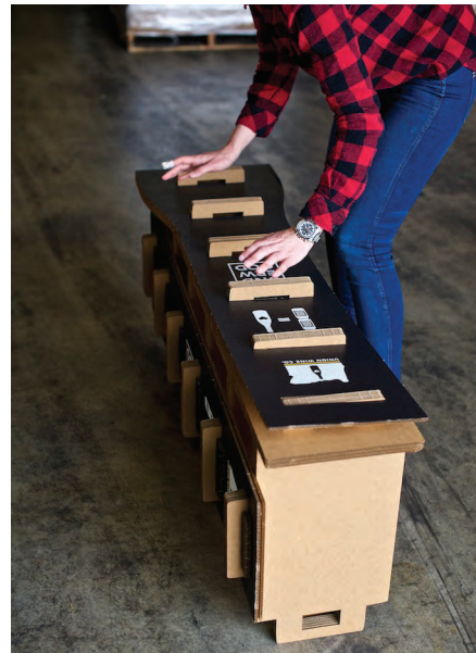
2. Side w/shelves