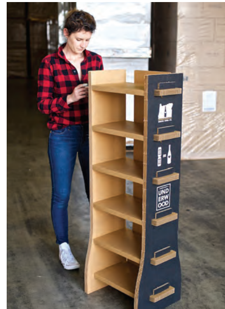
3. Other side